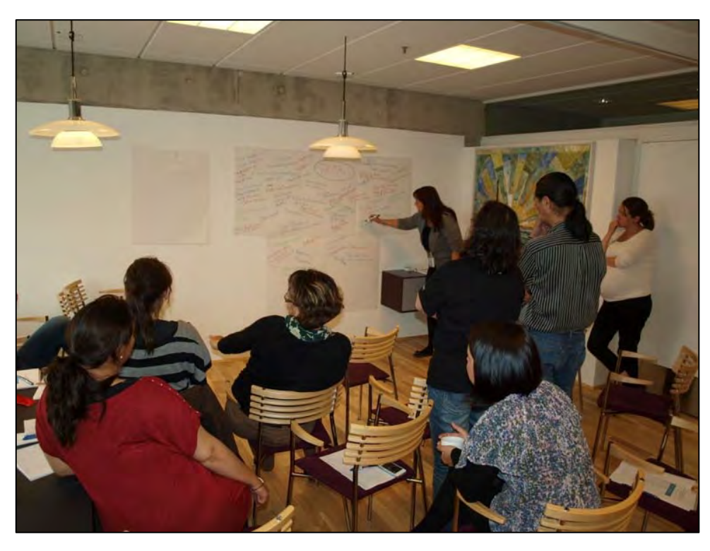
Fig. 3.3 - From a workshop

the social workers described their working life as being atomized. They handled a large number of very critical cases alone, without any steady management or any robust institutional framework. This led to a high level of job turnover, because many of the social workers could not realize their ambitions of supplying the necessary help in a system that could not offer the much-needed support for clients such as a mother-and-child home, housing for the homeless or relief care services. Other findings were about the unsatisfactory levels of salaries, stress, threats, violence and a feeling of professional insecurity based on the fact that they were all working individually and not as a group (Arnfjord Hounsgaard, 2015). A solid understanding from this first phase was that the social workers did not refer to any form of overall (meta) professional identity or affiliations. They clearly requested a professional organization.