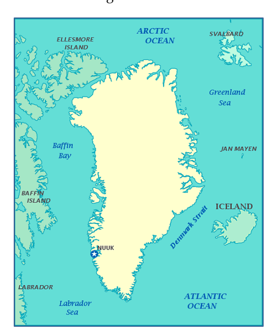
Fig. 3.1 Greenland

citizens and unheard minority groups (e.g. children, young citizens and homeless people).